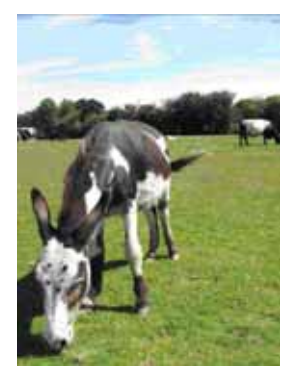
... and other livestock.