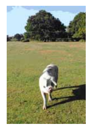
...as do pigs