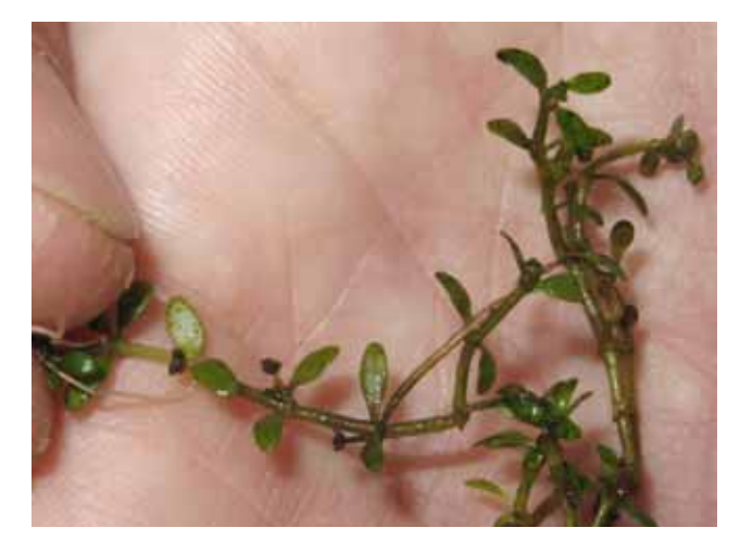
Six-stamened Waterwort Elatine hexandra Blashford Lakes 26 August 2009 by Debbie Allan

nuttallii and Crassula helmsii, but after some diligent searching through handfuls of weed we eventually found a few small sprigs of the important species we had been looking for, Six-stamened Waterwort Elatine hexandra (see photo). Clive also managed to find some rooted plants, confirming that it was actually growing here and not just washed up from elsewhere in the lake. The species has been previously recorded at least once here and also from Ellingham Lake, but is very rare elsewhere in SW Hampshire (best known from Hatchet Pond). It is also known from several areas in NE Hampshire. Another good find was some poorly-growing Potamogeton pusillus , later confirmed through the microscope (by its distinctive marginal leaf vein) - a new tetrad record.