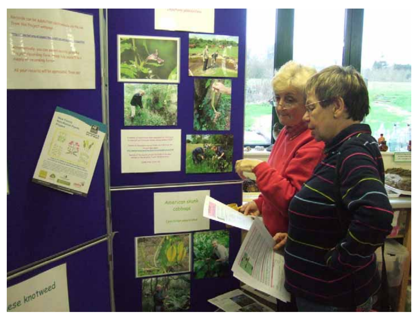
Flora Group members at Flora Group/BSBI exhibition meeting at Testwood Lakes in December 2009