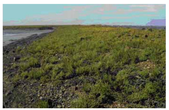
Salicornia dolichostachya, Salicornia fragilis and Sarcocornia perennis on the Hayling Oyster Beds

After a cold start on Hayling we enjoyed excellent sunny weather for the rest of the week, and there were plenty of incidental pleasures including an Osprey sighting and the discovery of a large population of Oak-leaved Goosefoot ( Chenopodium glaucum ) at Keyhaven. Needs Ore was particularly satisfying, as a good natural marsh profile from silty and gravelly upper marsh to creek and mudflat survives reasonably intact; the small marshes of the western Hamble, although much more restricted, were also a delight. Thanks to all those people who spent one or more days on the marsh, risking life and welly and contributing to the communal head-scratching.