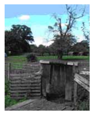
A pig gate between the field and the common.