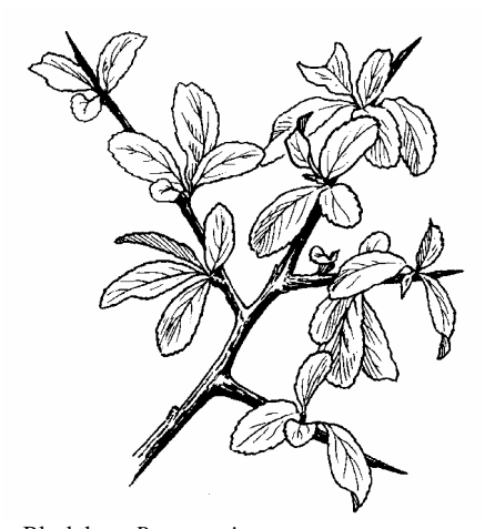
Blackthorn Prunus spinosa (Illustration by Charlotte Matthews)

red-belted clearwing Synanthedeon culciformis and this feeds under the bark of birch trees. Newly emerged adults have been found on stumps of cut trees in May and June. We have planted numerous buckthorns to encourage brimstone butterflies.